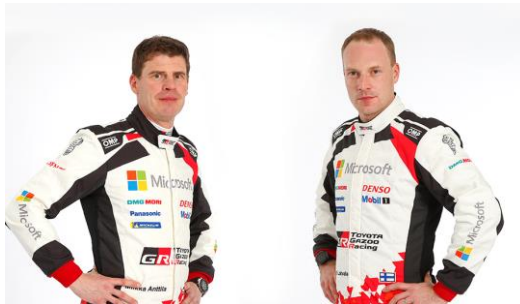
Miikka Anttila and Jari-Matti Latvala

"It was a great feeling for us to win in Sweden, but we quickly changed our focus to Mexico. We flew straight to Spain for two days of gravel testing on the Monday and Tuesday after the rally. We worked on a number of different things, just trying to be as well-prepared as we can be. The whole team has been working hard and I believe we should be competitive in Mexico. As championship leaders, we will have to run first on the road on the Friday. It won't be easy but we saw in Mexico last year that it is possible to have a good result from this position, so let's see how it goes."