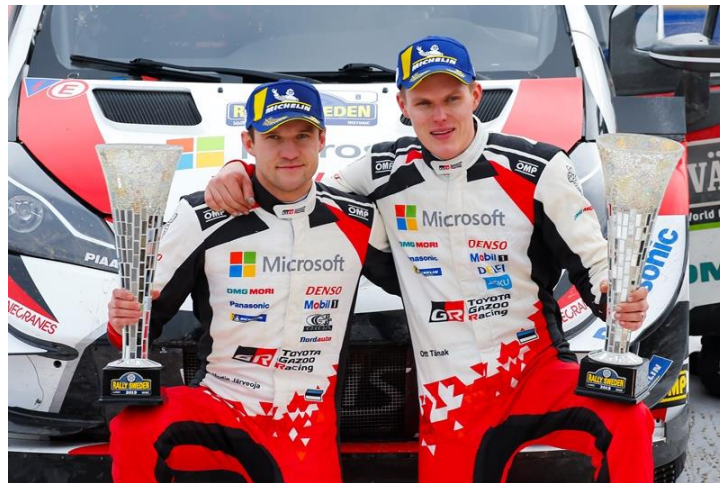
Ott Tänak and Martin Järveoja (Car 8)

Following its victory on the snow and ice of Rally Sweden to take the triple lead of the manufacturers', drivers' and co-drivers championships, the TOYOTA GAZOO Racing World Rally Team is preparing for a very different challenge on Rally Mexico: the first true gravel event of the season. Ott Tänak heads to Mexico on top of the drivers' standings for the first time after his Swedish success, while his team-mates Jari-Matti Latvala and Kris Meeke are both past winners of the event.