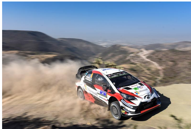
Rallye Mexico 2018

In his first rally on gravel in the Toyota Yaris WRC, Ott Tänak showed good performance in Mexico, lying third overall and within reach of the lead before suffering a turbo issue on Saturday morning. He restarted on Sunday and won the Power Stage ahead of Jari-Matti Latvala, who finished eighth overall under restart rules following an alternator failure on Friday. Esapekka Lappi was also forced to restart in the third Yaris WRC after going off the road.